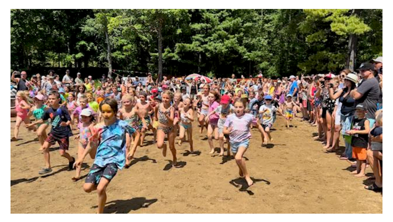
What kid doesn't like to eat candy at the 65th Annual Regatta.

EVENT - Saturday Aug 26, 2 pm - 9 pm 75th Anniversary Celebration Party LKRA & Stoney Point Marina